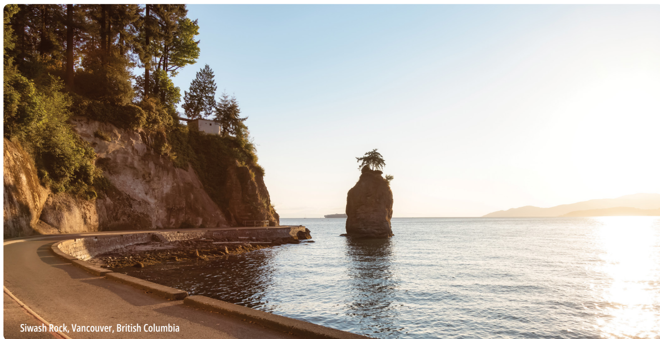
Siwash Rock, Vancouver, British Columbia

Programs are available for independent students or groups, with flexible program lengths and homestay options on request.