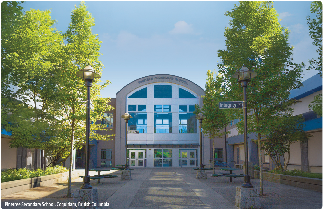
Pinetree Secondary School, Coquitlam, British Columbia